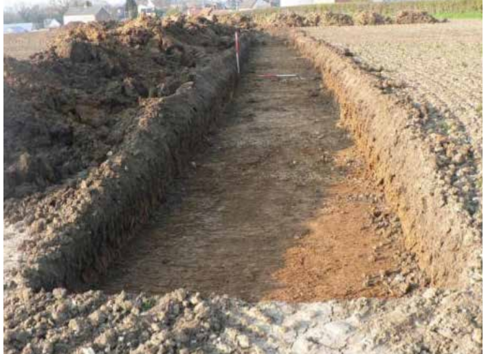
Trench 1 from southeast

It may have lacked the glitz and glamour of a Hollywood film, but recently we had our very own archaeological dig adjacent to Duke Street. The findings were somewhat common place in comparison to those at Sutton Hoo, but nonetheless interesting to residents who live nearby. A Roman brooch, some post-medieval coins, buttons and musket balls were all uncovered in the dig, which was undertaken to examine the historical importance of the area currently being developed in Duke Street.